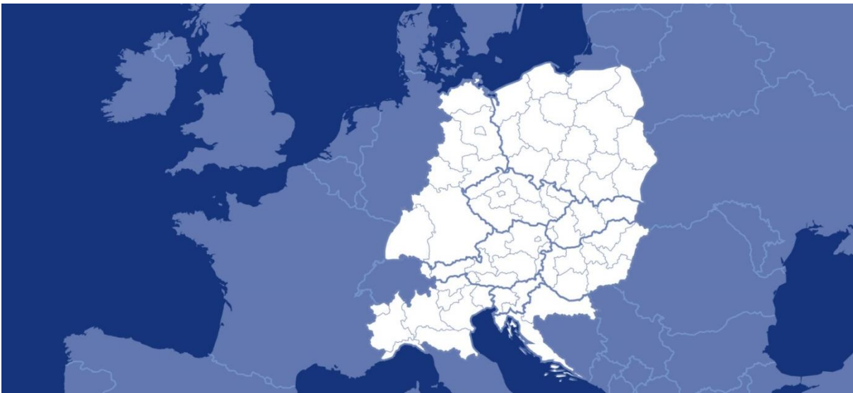
Figure 1: Programme area of Interreg CENTRAL EUROPE

Central Europe is highly heterogeneous in geographical terms (marked by coastal areas, mountain ranges, rural areas, large urban agglomerations etc.) as well as in economic and social terms (exposing the lingering east-west divide). The programme area has a large number of assets but also faces numerous challenges in various fields affecting regional development, which have all been thoroughly analysed before concentrating the programme on four strategic priorities. Results expected from the programme will directly contribute to reaching goals of the Europe 2020 Strategy.