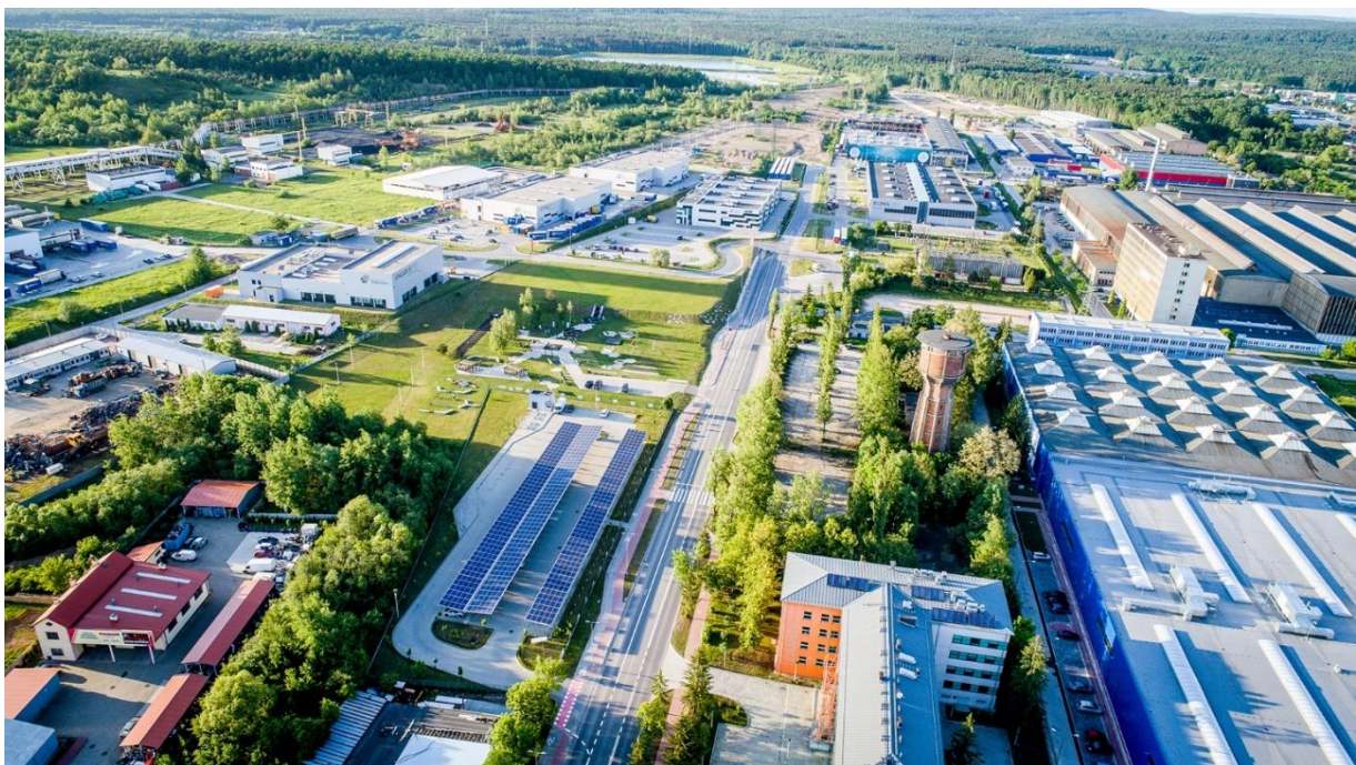
Photo: Kielce Technology Park area

As part of the UrbanInno project, it promotes the idea of a smart city, consistent with the city's vision, based on documents prepared by the City of Kielce, actively participating in the sessions, workshops and consultations, and preparing projects and projects that fit the path adopted by the city authorities in this regard.