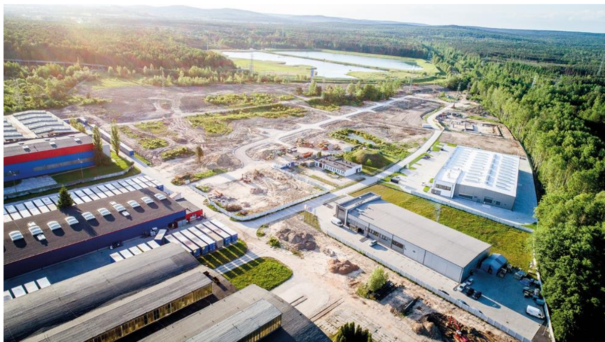
Photo: Investment area of Kielce Technology Park

Based on the SWOT analysis carried out by the city, the following picture of the current situation in particular areas is presented, a few selected from each area were selected.