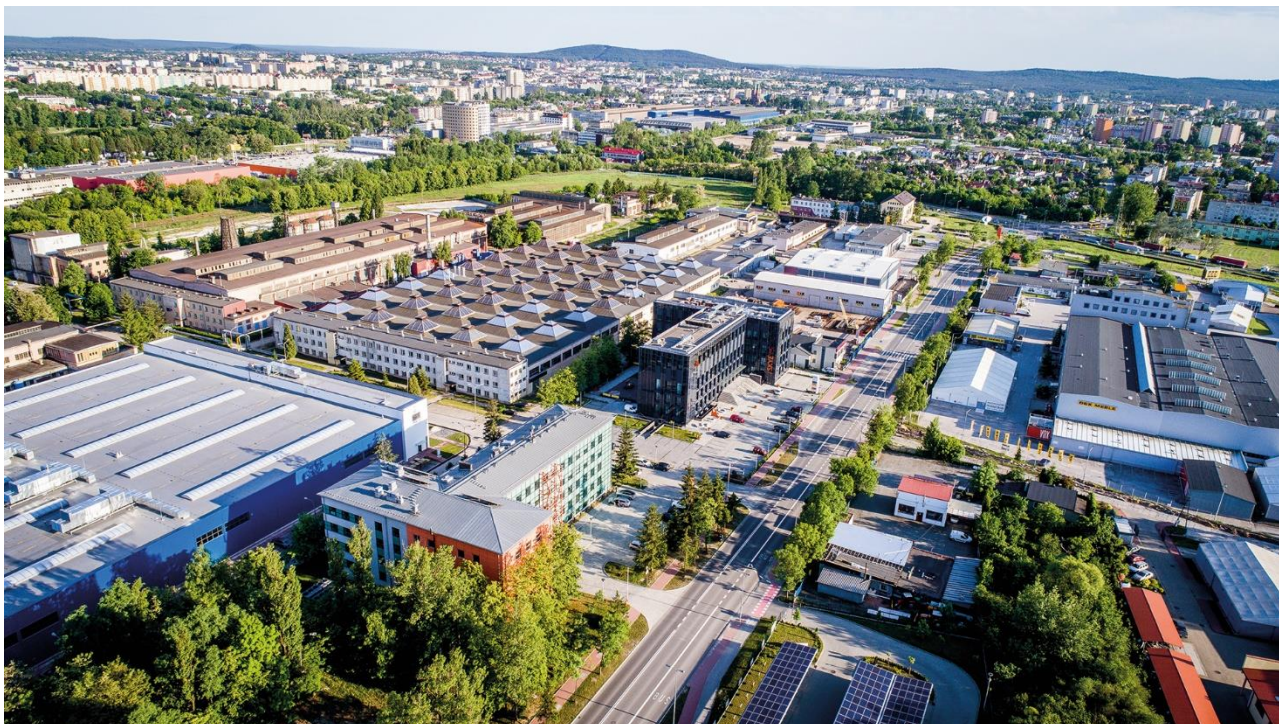
Photo: Kielce Technology Park incubators; SKYE Inc and ORANGE Inc.