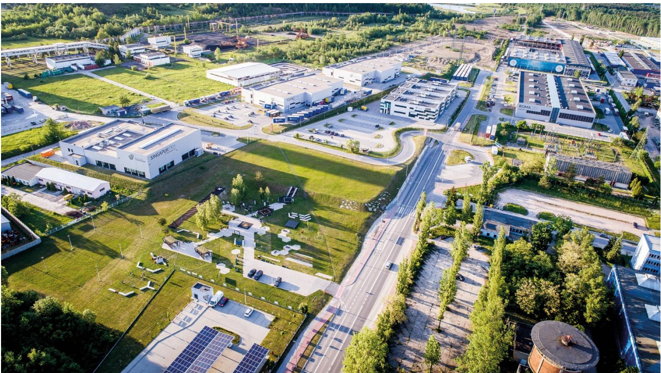
Photo: Kielce Technology Park area

Work on the Smart City of Kielce 2030+. The Strategy Committee for the Steering Committee and the Project Committee.