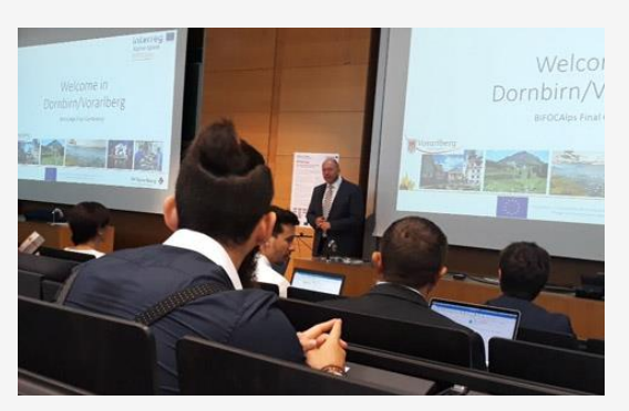
BIFOCAlps final conference