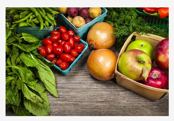
TUKE-KOŠICE Pilot Innovative Urban Food System – digital market of agricultural products and the innovation of subsidiary processes