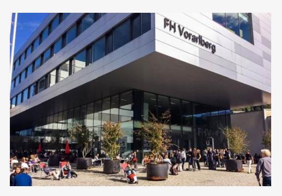
Transnational training for facilitators

A toolbox of Smart urban innovation participatory methods & tools is a unique tool that will help you to engage end-users (citizens, consumers) into urban innovation process: urban development strategies, smart urban solutions, services or technologies. The Tool is one of the major project outputs published as an online tool, as well as in printed version.