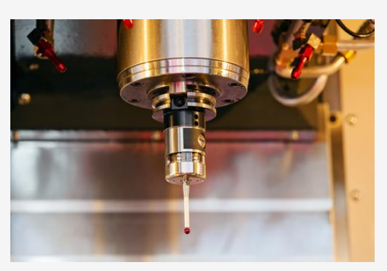
VAS COUNTY Pilot Multidisciplinary Science Center

Smart City tool for managing organizations networks, boosting innovation and development