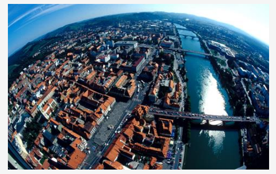
MARIBOR Pilot Integrating public infrastructures and end-users through common platform (single entry point)