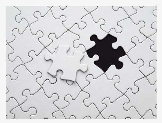
Matchmaking of participatory methods and pilots

BURGENLAND Pilot: Energy Strategy 2050 Innovative participative solutions for engaging all stakeholder groups during the development of an energy strategy and a hybrid district heating system