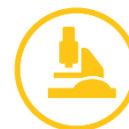
TABLE 3: ACTIONS AND ACTIVITIES FOR ACHIEVING THE SECOND SCALING OBJECTIVE