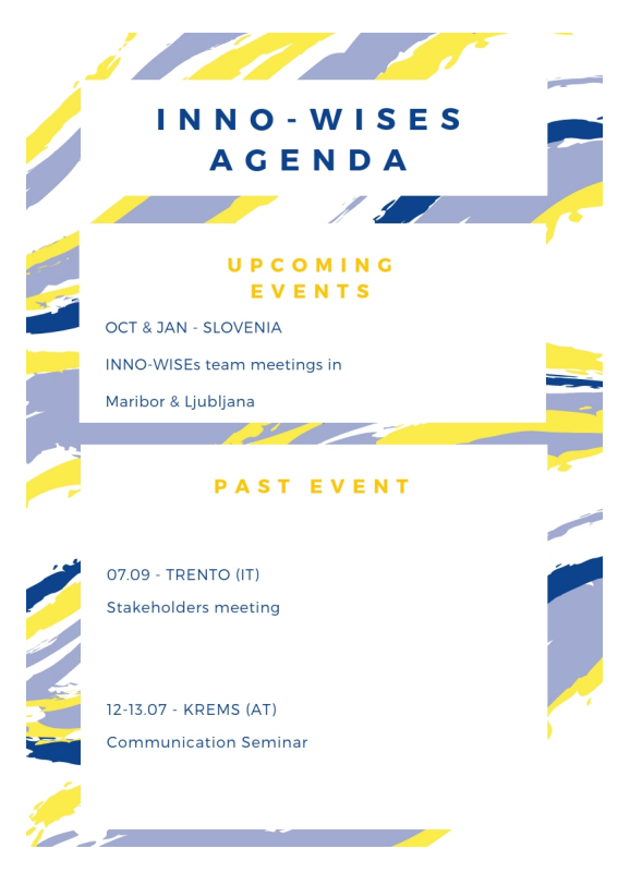
Click on the picture to enlarge it.

The first infographic explains, in four steps, how does INNO-WISEs work to the widest public possible.