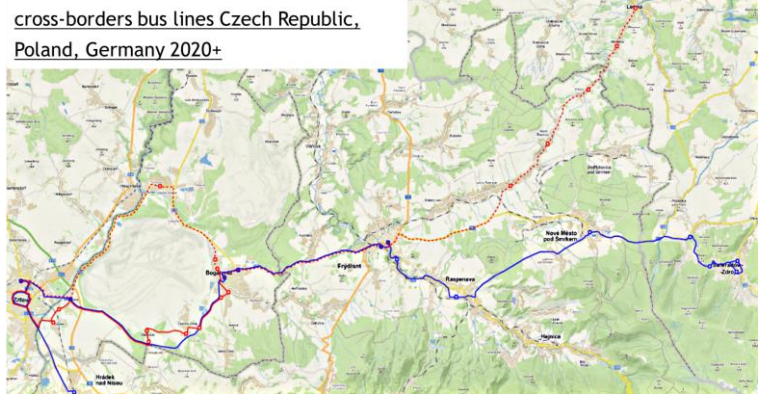
cross-borders bus lines Czech Republic, Poland, Germany 2020+

The two cities Zittau in Germany and Bogatynia on Polish territory are only 15 kilometres apart. Nevertheless, there has been no public transport connection between these two cities since the Second World War. To strengthen the connections within the border triangle, we investigated and planned a bus line from Zittau via Bogatynia to the Czech town Frýdlant v Čechách, with a connection to the Polish health resort Świeradów-Zdrój on weekends. In our planning, we divided this corridor into two bus lines: line 831a between Zittau and Bogatynia (daily running) and line 691 (on the whole corridor for leisure traffic).