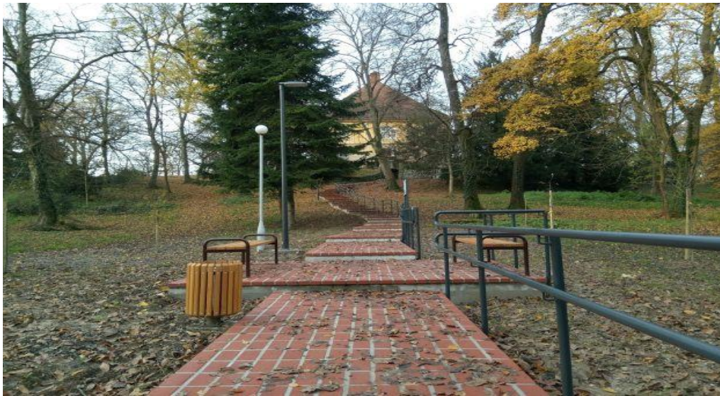
11 2019 Opening ceremony