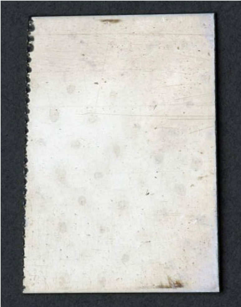
CCI 125773-0027 Figure 18. Sterling silver showing a transfer of the dot pattern.

Figures 16 to 18: An experiment was carried out at CCI to check if gloves made with PVC nodules pose a risk for objects. Sterling silver (92.5% silver and 7.5% copper) was tested because this alloy reacts rapidly with many harmful agents and the result is visible to the naked eye. The sterling silver sheet was placed in direct contact with a Sure Grip cotton glove (Figure 16). After exposure to direct sunlight for nine weeks, the glove's grip nodule pattern (shown in Figure 17) had transferred to the sterling silver (Figure 18). This indicates that the grip nodules transferred a material that could corrode the alloy. The conclusion is that it is best to avoid using this type of glove for handling objects.