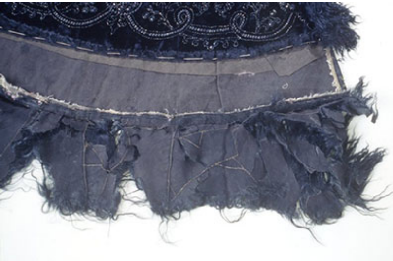
Figure 2a. This beaded, black velvet cape from the late 19th or early 20th century appeared to be in good condition overall, but a closer examination of its fur trim and collar revealed that the fur was so weak that it was at risk of tearing when handled.

© Government of Canada, Canadian Conservation Institute. CCI 2005467-0002