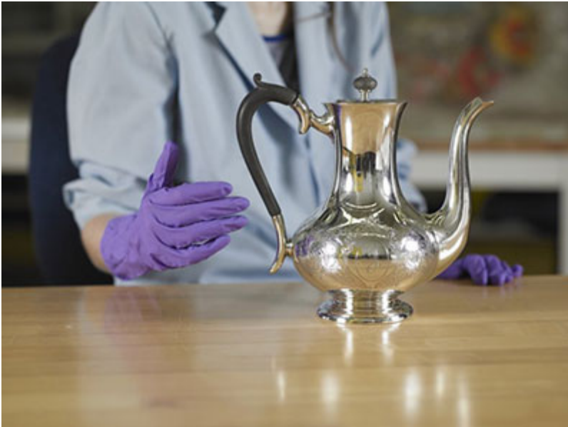
Figure 3. A coffee pot that needs to be moved stands on a counter.

Joints, ties, adhered components, etc. may be damaged, worn or loose. Often, weaknesses at joints and points of assembly are not conspicuous until closely inspected (Figures 3 and 4).