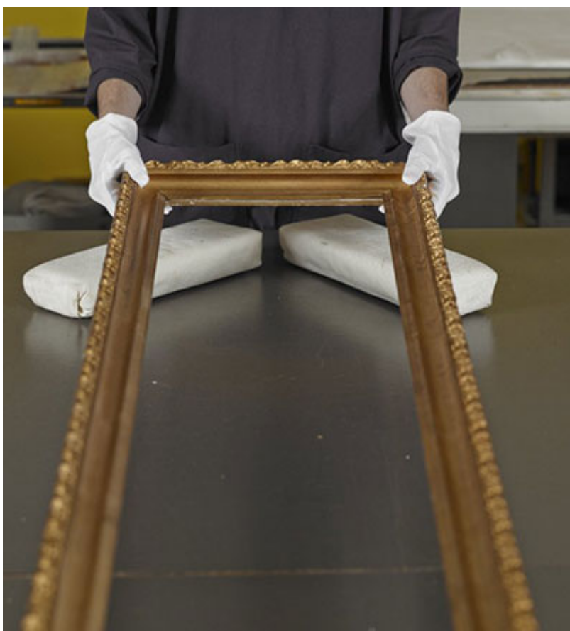
Figure 8. Gilded surfaces should be handled with gloves. This image shows a gold-painted frame rather than gilt; nevertheless, if the surface is unfamiliar, the handler should always wear gloves.