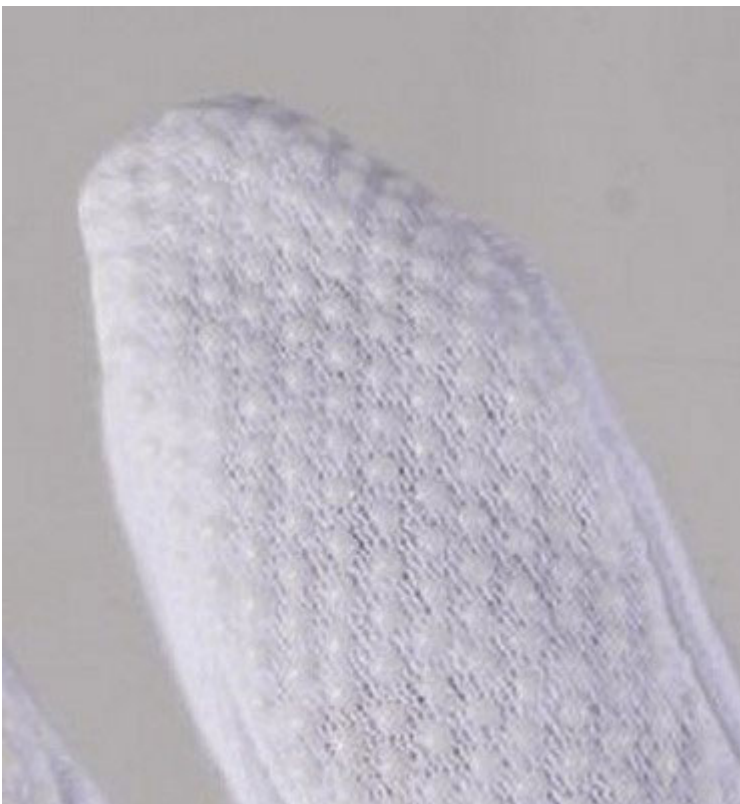
Figure 17. Detail of PVC dots.