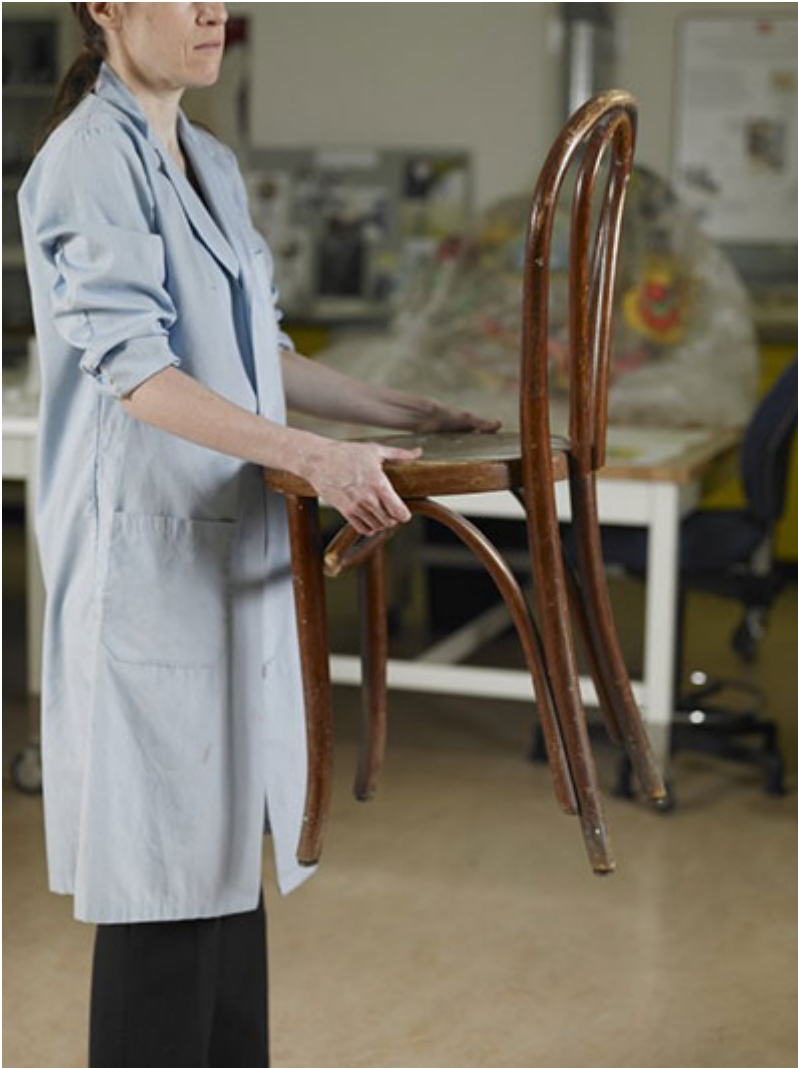
Figure 33. To safely carry a chair, grasp each side of the seat and lift.