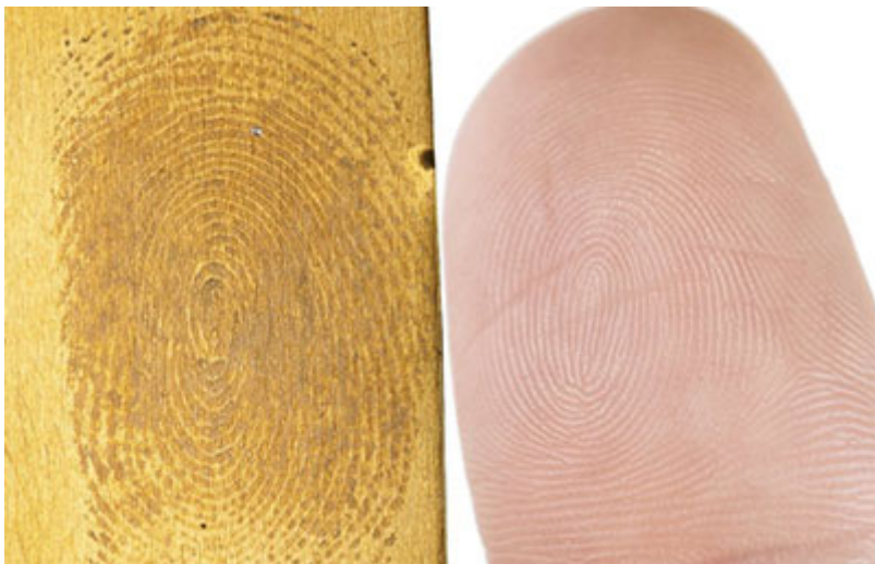
Figure 7. A clear fingerprint on brass due to touching with bare hands.