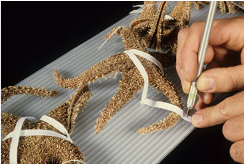
Figure 29b. Detail of a storage mount. This mount also allows for the safe movement of the small antler sculpture as it holds components in place in the foam mount.

CCI 125773-0043