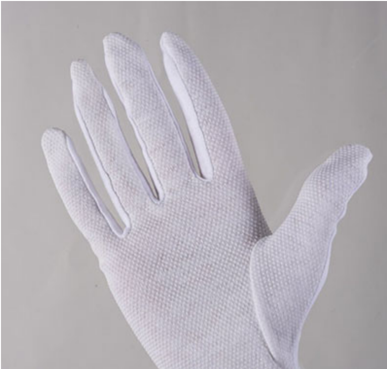
Figure 16. Sure Grip cotton gloves with white PVC dots (or nodules).