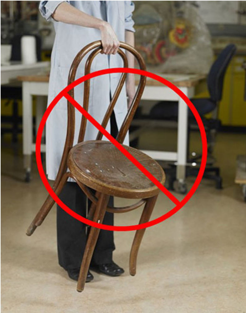
Figure 32. Avoid lifting chairs from the top of the back.