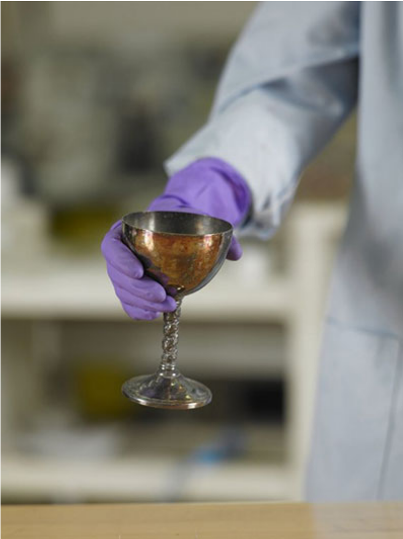
Figure 10. Wear gloves (nitrile seen here) when handling metal objects.

Applied pressure to unclean surfaces (dusty, soiled) can cause dirt to be forced more deeply into a substrate. If the pressure is applied by hands, the perspiration and oils fix the dirt in place, especially on porous or rough surfaces.