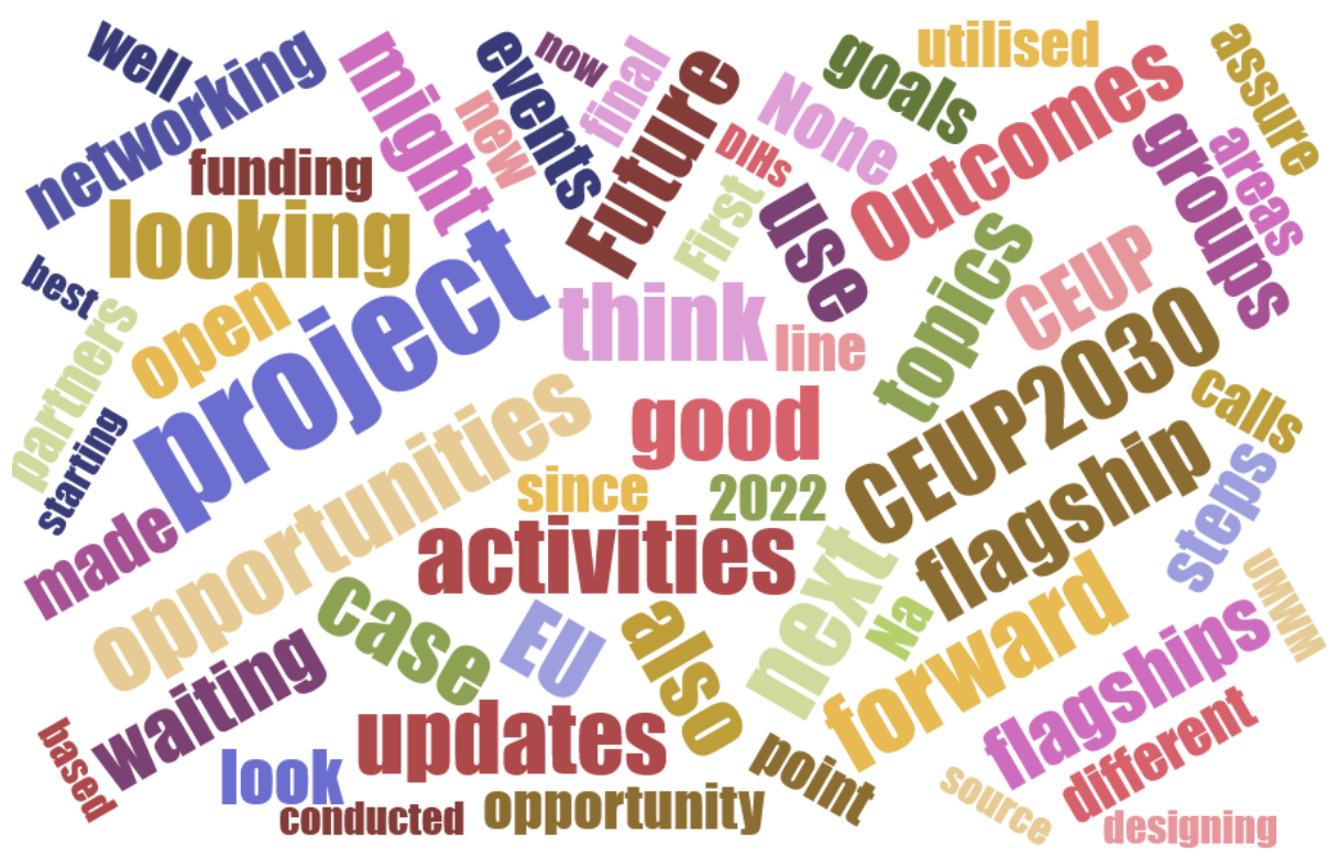
Figure 11 Word-cloud analysis for Question 8

Finally, the reviewers are looking forward to the expected future benefits of having physical meetings and workshops upon the end of the COVID-19 pandemic. The pandemic has made its impact on limitations to physical presence at the events and inability to meet with foreign partners. Through active moderation commonalities can be discovered and the benefits of collaboration and networking can be used.