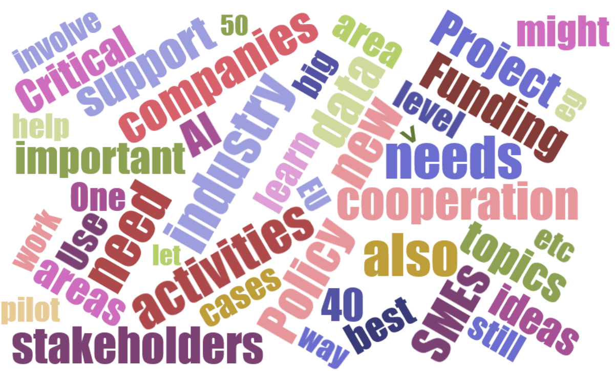
Figure 10 Word-cloud analysis for Question 7

Some other specific examples of important topics were mentioned: Data Sharing Economy, Industry 5.0 solutions, Human-Centred Technology, New Mobility, Zero Defect Manufacturing, Sensor Systems based on Smart Materials, Dual use technologies applied to textile, Data management and Artificial Intelligence, etc.