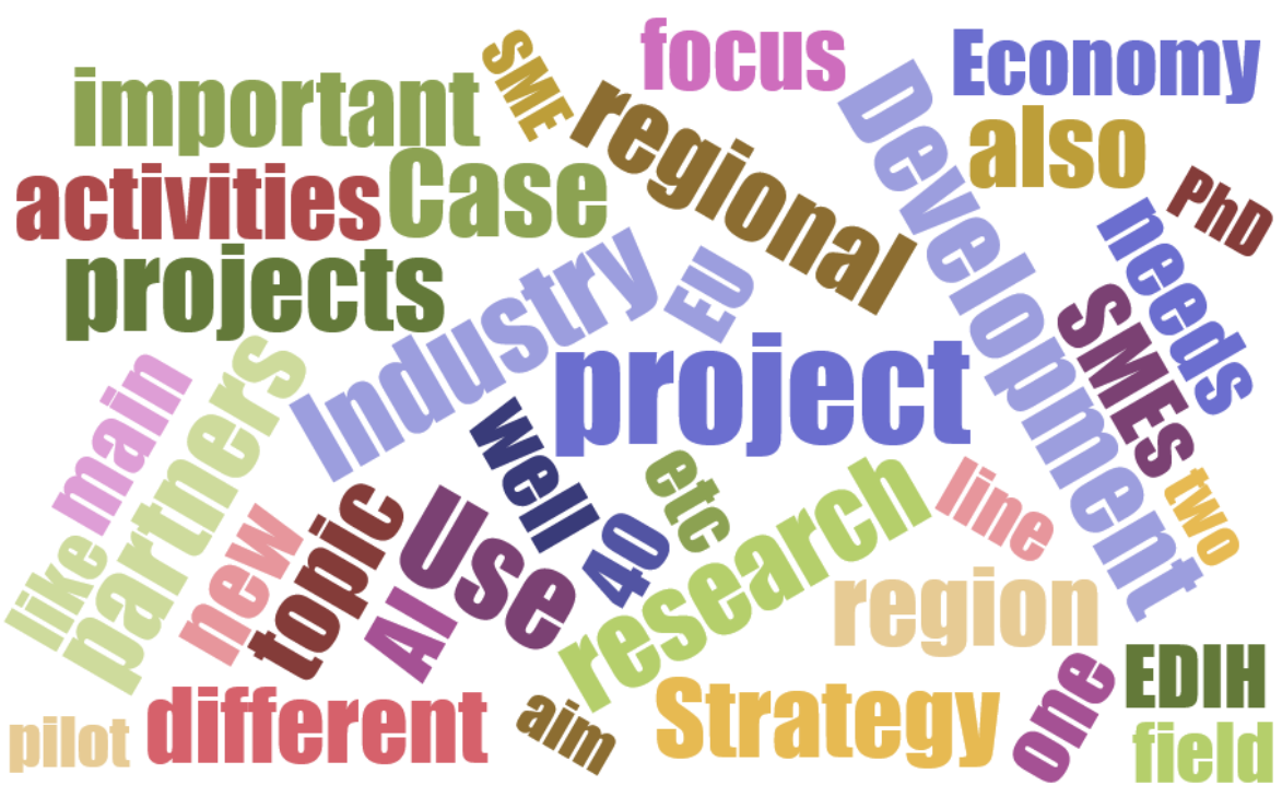
Figure 4 Word-cloud analysis for Question 1

In a significant number of use cases there is already triple helix cooperation including collaborating closely with regional authorities in order to align the activities and strategies. Some best practices noted by the peer reviewers include: building upon previous involvement of consortia members in the topics addressed by the Use projects and previous collaborations with positive experience and results, and ensuring a well-balanced composition of the consortia, in order to bring together partners from different groups, such as those from academia, innovation centres, i.e., Business Support Organisations and SMEs.