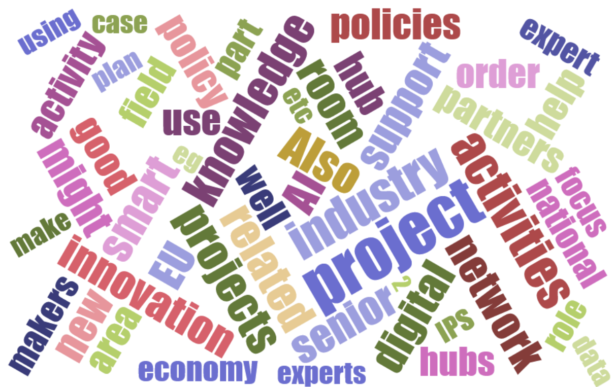
Figure 7 Word-cloud analysis for Question 4

In that perspective, strong dissemination and awareness raising activities are important. Creating strong communication plan for the project which will help to reach out project objectives to various stakeholders and in endgame - help in better commercialization of the project. There are lots of initiatives that can help in accomplishing this.